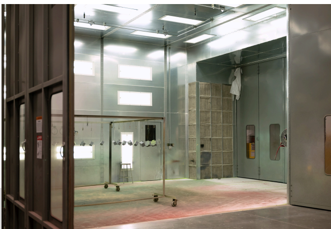
20' W X 16' H X 40' D CROSS DRAFT PAINT BOOTH

The high density of M&R's screen-exposure LEDs provides the finest detail, the most uniform coverage, and the quickest exposures available.